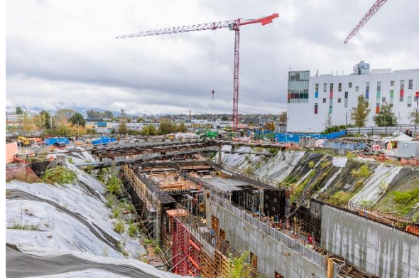
Figure 2: Great Northern Way-Emily Carr Station: Progressing with rebar installation on the transition box roof.