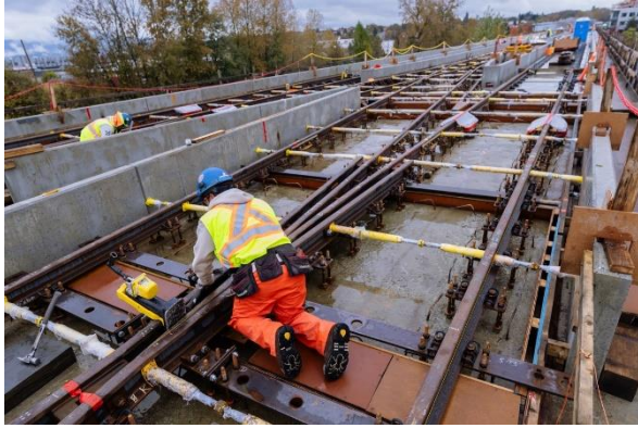
Figure 1: Elevated Guideway: Progressing with alignment of the west track switch for the pocket track.