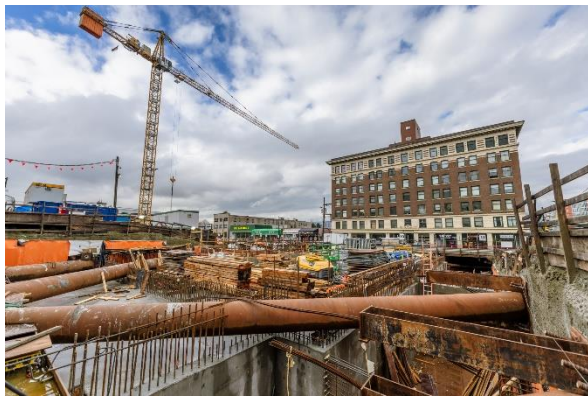
Figure 3: Mount Pleasant Station: Completion of the concourse-level roof slab in the headhouse.