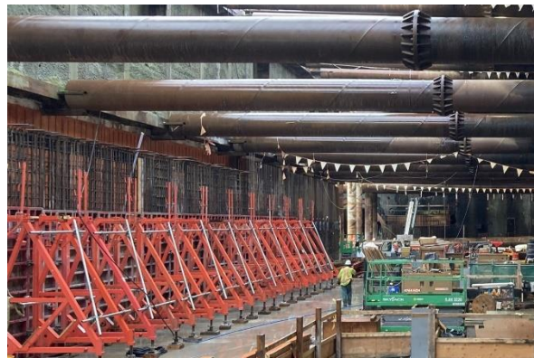
Figure 4: Broadway-City Hall Station: Progressing with construction of the concourse-level walls.