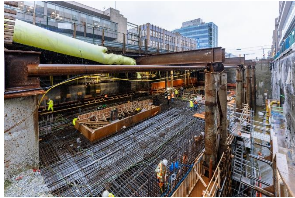
Figure 6: South Granville Station: Progressing with rebar installation for the concourse-level floor in the station box.