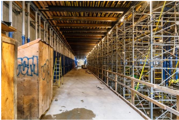
Figure 5: Oak-VGH Station: Progressing with shoring to construct the concourse slab in the station box.