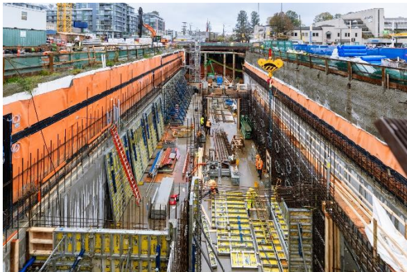
Figure 7: Arbutus Station: Progressing with construction of the walls in the headhouse.